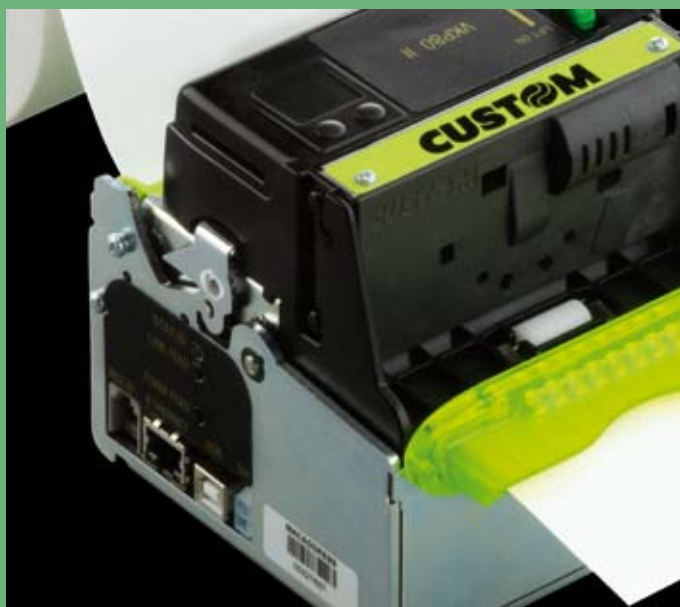
ETHERNET VERSION WITH WEB SERVER