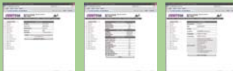
WEB SERVER EMBEDDED