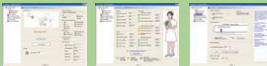
FULL STATUS MONITOR