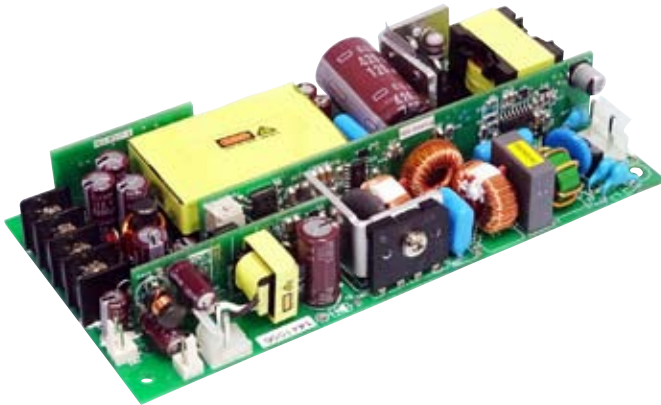
3" x 6" x 1"