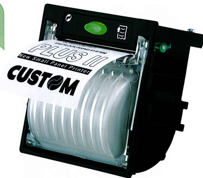
Beige color version.