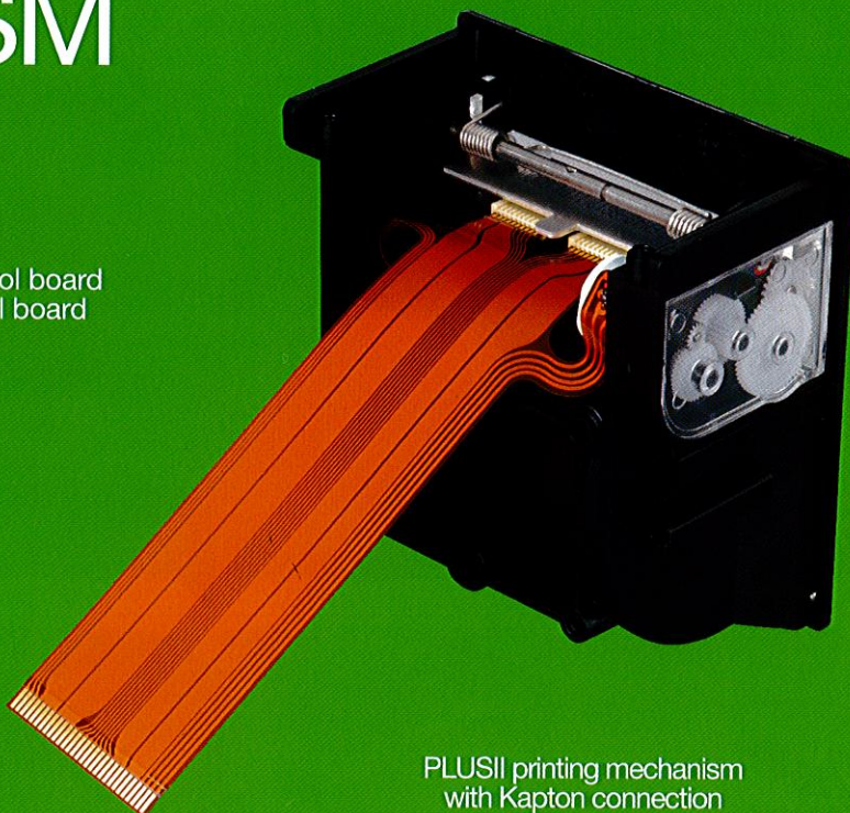
PLUSII printing mechanism with Kapton connection